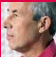
Symbio 320 – In the Canal instrument (ITC), discreet solution and fully automatic.

Contact your hearing care professional today and learn more about the benefits that Symbio can offer. Your specialist will recommend the best possible solution adapted to your requirements.